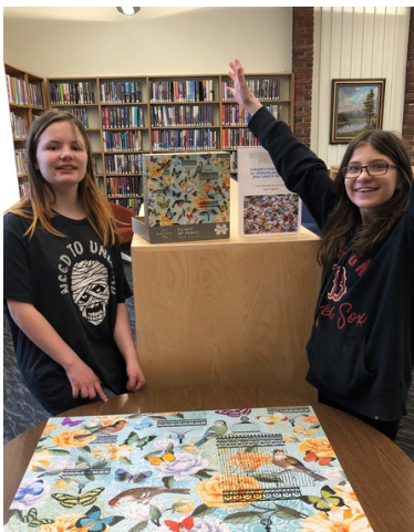
Some of our teen patrons celebrated completing our community puzzle!