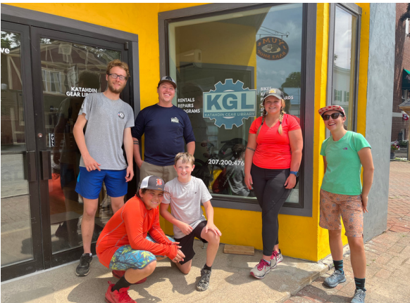
Participants and staff outside of the gear library's downtown location after a mountain biking program this summer.