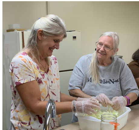
We offered a series of hands-on programs this year on canning and preserving.