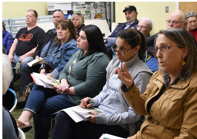
We partnered with Katahdin Federal Credit Union this year to offer workshops on topics like wills and power of attorney.