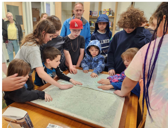
This spring, every Granite Street School class toured the library and learned about the resources we have to offer.